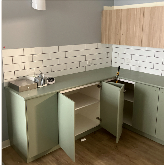
New cabinetry is being fitted