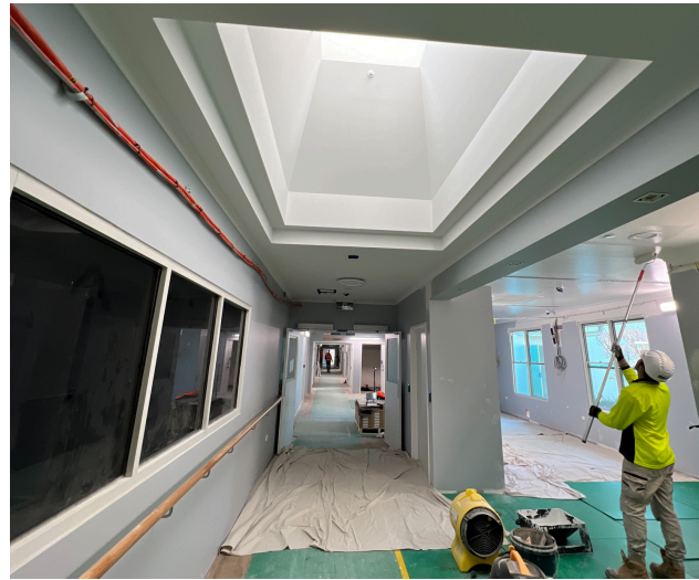
Painting the aged care wing

Door installation is complete, cabinetry is being fitted and the final painting work is underway. The program of works remains on track for completion before Christmas.