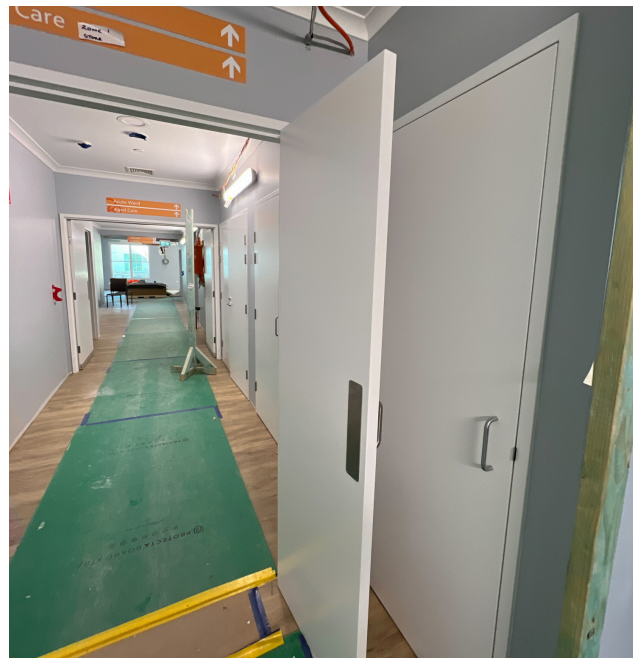
New doors are installed