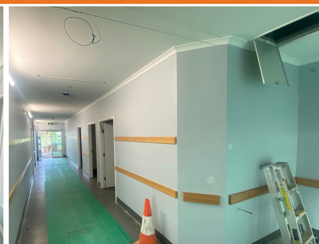
Laundry services flooring is complete