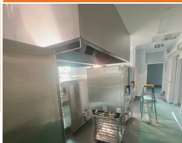
Kitchen equipment is being installed

Works are progressing rapidly, with the majority of the new flooring installed. The program of works remains on track for completion before Christmas.