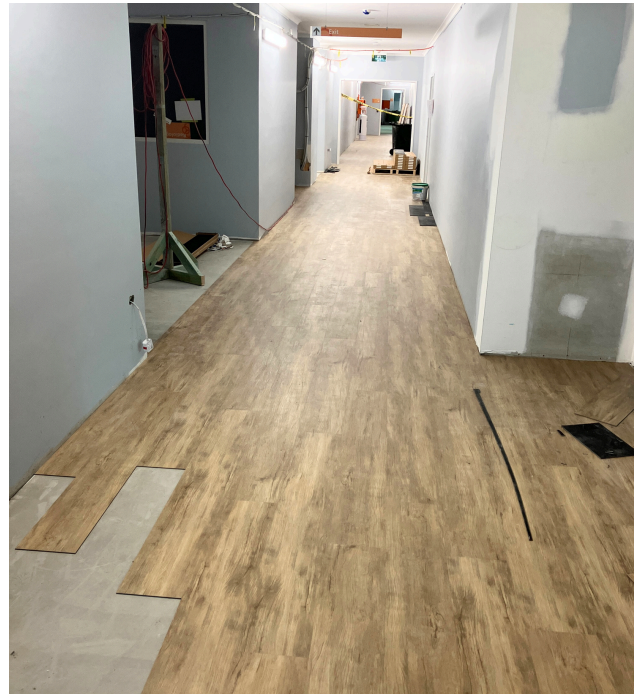
Community Care flooring installation