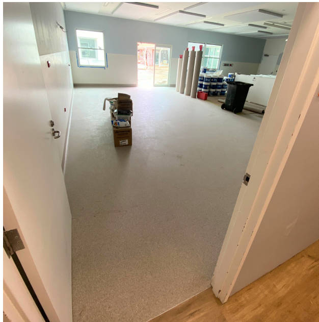
Gym flooring and painting is complete