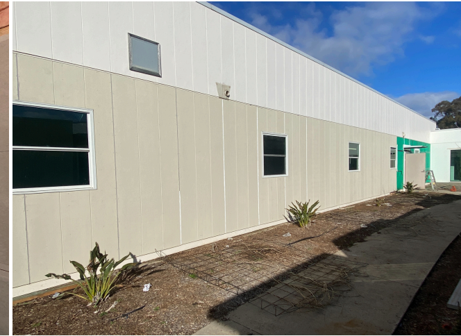
Cladding Kitchen and Laundry wing

We have a big community celebration planned to welcome everyone back to REDHS.