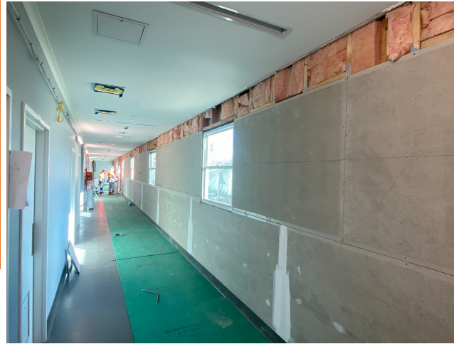
Inside the Kitchen and Laundry wing

From the outside the facility is starting to look like a hospital again, with the installation of the external cladding and window treatment work almost complete. The colour scheme nicely complements the surrounding environment.