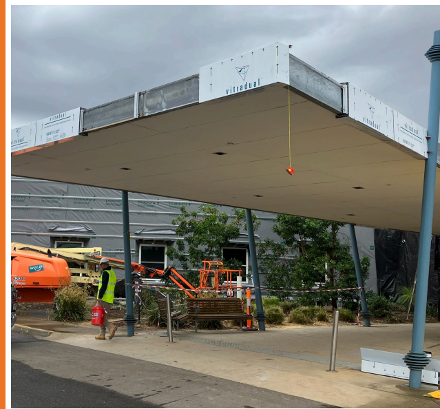
Working on the Main Entrance