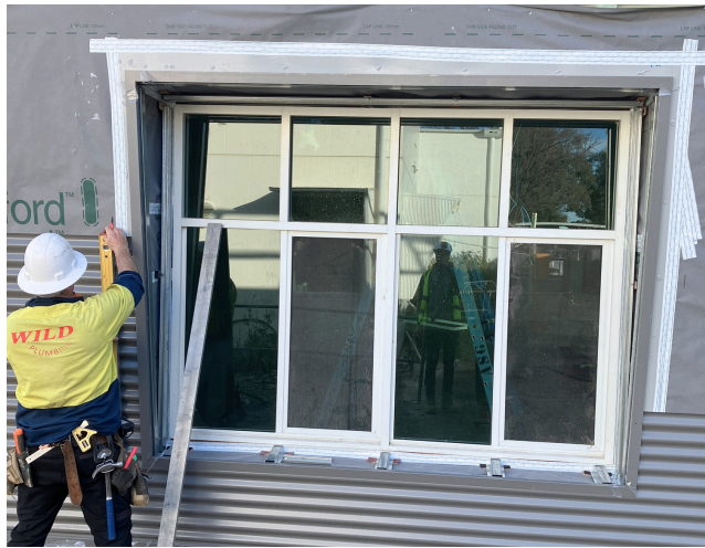
Cladding & window treatment installation